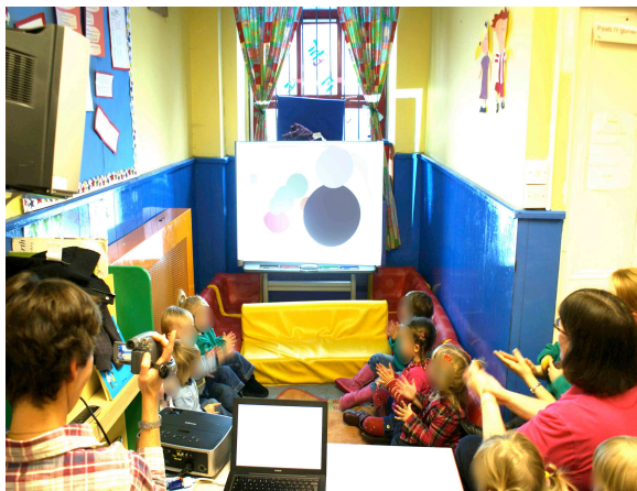
Figure.2 The technology set up in the playgroup

Intervention from the practitioner clearly assisted the children in the gaining confidence to playfully interact within the environment. High relevant to this, the practitioner immediately felt able to organize an activity without assistance from the researchers, having witnessed a demonstration of the software and some impromptu interaction from children, Figure 2. Thus the playfulness arose as a mutually enjoyable experience and acceptance of the technology was established. As a direct consequence, further ideas flourished, most notably the practitioners could articulate ways in which the technologies could be used to augment existing play strategies.